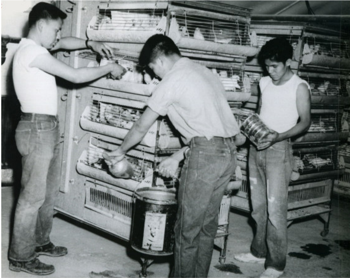
Founded in 1883, Chilocco was operated as a boarding school until 1979. Currently the buildings are vacant. Chilocco, OK